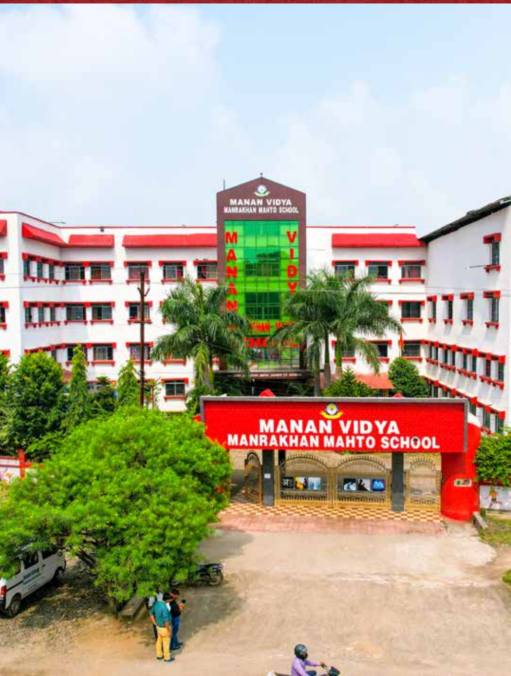
MANAN VIDYA MANRAKHAN MAHTO SCHOOL