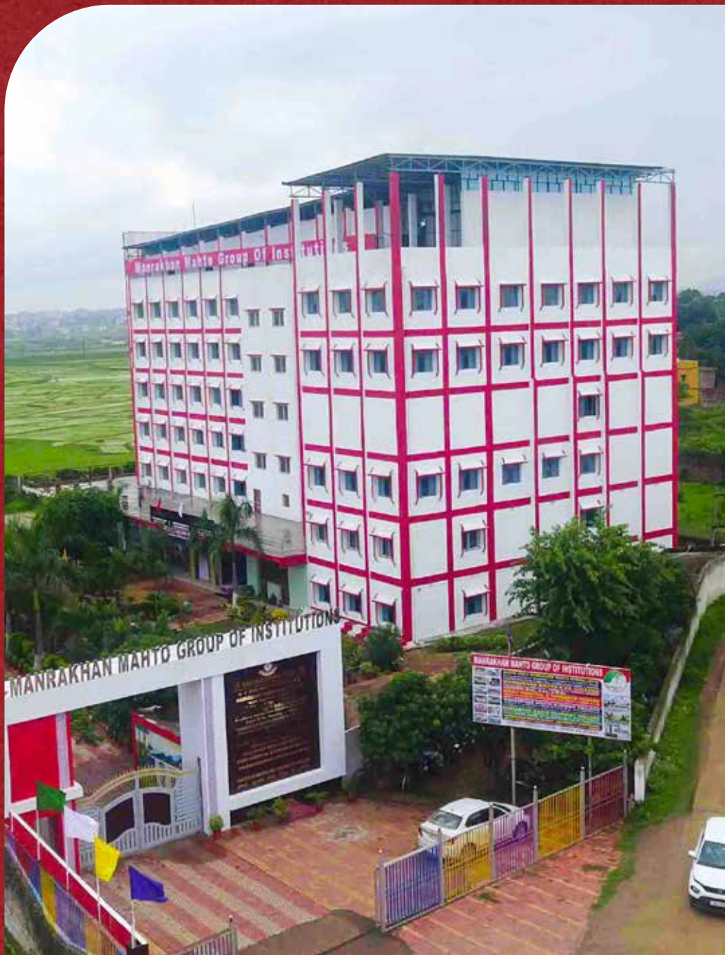
MANRAKHAN MAHTO GROUP OF INSTITUTIONS