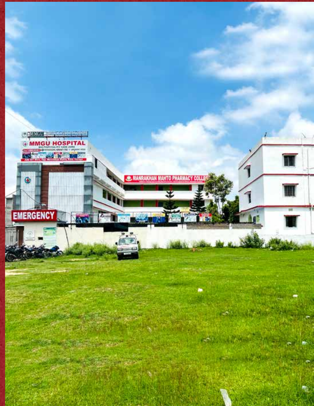
MANRAKHAN MAHTO PHARMACY COLLEGE