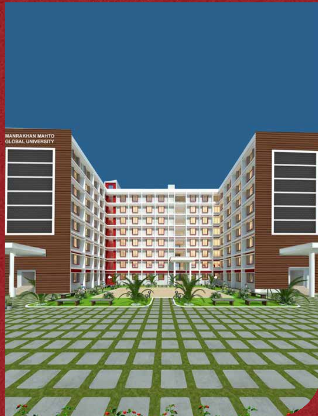
MANRAKHAN MAHTO GLOBAL UNIVERSITY (PROPOSED)